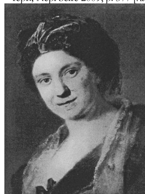
J.21.0132 AUTORITRATTO, pstl/ppr, 57.2x47 (Royal Collection RCIN 452375. Artist; don: Consul Joseph Smith, Venice; inv. 1762, no. 22, as 64.4x56; acqu. George III, 1762). Exh.: London 1946b, no. 71; London 1951a, no. 26; London 1988b, no. 66; London 1993b, no. 104; London 1994, no. 45 repr.; London 2002b, no. 378 repr. cl; London 2016b, no. 27 repr. Lit.: Malamani 1910, p. 102, as known only from engr.; Cust 1913, p. 153; Levey 1956, pp. 38f; Pallucchini 1960, fig. 116; Levey 1964, no. 446, pl. 212; Vivian 1971, p. 173; Levey 1980, fig. 103; Sani 1988, no. 324, fig. 284; Venice 1995, p. 103; Russo 2003, p. 112; Calabrese 2006, fig. 217; Carriera 2007b, p. 146 repr. bw; Burns 2007, fig. 42; Sani 2007, no. 376 repr.; Roberts 2008, p. 245 repr.; Tormen 2009, p. 239, fig. 1; Oberer 2020, fig. 31 φσ