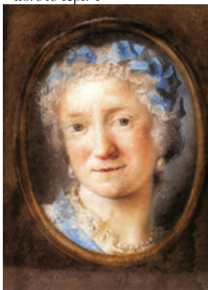
J.21.0127 ~version, pstl/ppr, 41.7x30.9 ov. (Milan