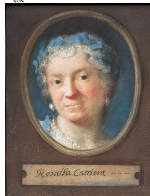
J.21.0128 ~cop., pstl/canvas, 32x26 (PC 2017) φκ