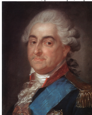
STANISLAW II AUGUST, a/r Lampi pnt., 1788 (Hermitage, inv. ГЭ-1361)

J.5944.107 STANISLAW II AUGUST Poniatowski (1732–1798), roi de Pologne, pstl, 48x39, s ← “Pitschmann pinx.”, c.1789 (Warsaw, Muzeum Narodowe, inv. 20685. Don Konstante & Helena Tarasowicz 1919). Exh.: Warsaw 015, no. I.135 repr. Lit.: Maria & Andrzej Szybowsscy, Warszawski zamek królewski. zamek Rzeczypospolitei , Warsaw, 1989, visible in display; Waniewska 1993, no. 49 repr., as pstl; Guze & Kozak 2005, fig. 8; Warsaw 2011, p. 148 repr., as pnt. Φ