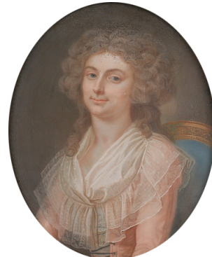
J.321.137 Greve Nils [Göran Nilsson] GYLLENSTIERNA af Björksund (1724–1799), riksmarskalk; & pendant: J.321.138 grevinna (∞ 1754), née [Eva Maria] Ribbing [(1730–1812)], pstl (Björksund, Södermanland). Lit.: Nordisk familjebok , 1908, VIII, p. 908 n.r.