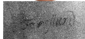
J.321.162 Sophia Charlotta REUTERCRONA (1770–1842), pstl, 58x47 ov., sd “Forslund 1788” (Stockholm, Bukowskis, 7.XII.2011, Lot 220 repr., est. SKr12–15,000, SKr26,000) φ