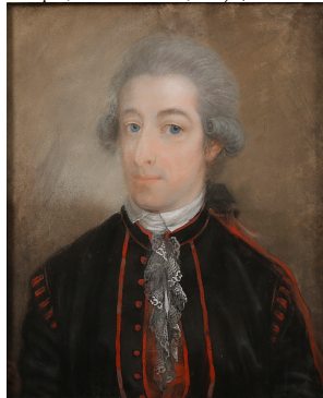
J.321.133 ~version, pstl, 32x25 [c.1780] (Stockholm, Nationalmuseum, inv. NMGrh 1586, as circle of Lundberg) [new attr.] φ