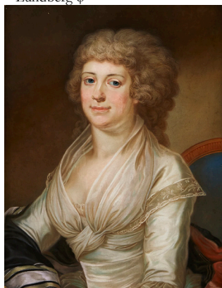
J.321.179 Pehr A. STROMBERG, pstl, 58x47 ov. (Uppsala, Auktionskammare, 28.III.1992, Lot 308 repr., SKr15,000)