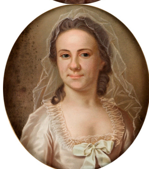
??SOFLA ALBERTINA, prinsessa av Sverige, tenant une lettre (Helsinki, Finnish National Gallery, inv. S23, attr. Forsslund) [v. Éc. fr. ]