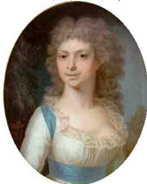
J.321.154 Eva Ulrica MÖRNER af Morlanda (1780–1796), pstl/ppr, sd 1797 (Stockholm, Bukowskis, 5.XII.2000, Lot 362 repr., est. SKr25–30,000, SKr22,000) φ