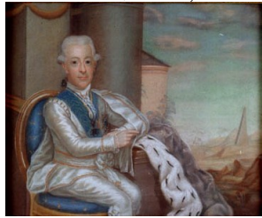
J.321.129 =?m/u, Stockholm, Konstakademie, 1799