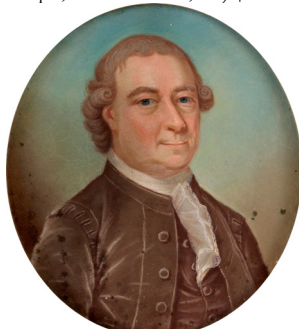
(Stockholm, Bukowskis, 1–4.VI.2010, Lot 232 repr., est. SKr15–20,000) \phi