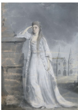
J.32.115 ~?An actress in the character of Jane Shore, crayons, Dublin 1771, no. 26