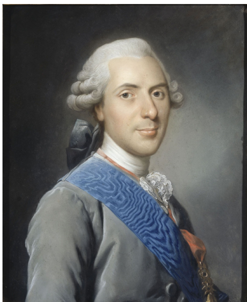
Fig. 4. Roslin, Louis le dauphin (Versailles)

There is an important example in his portrait of Fredrik Adolf, Hertog af Östergötland, of which both an oil and a pastel version were made in 1775. 12 Both are signed and dated, and it seems are very similar in finish, making the determination of priority as difficult as for the earlier example of the 1767 portraits of Louis le dauphin (fig. 4; the pastel, like the present work but unusually in Roslin’s œuvre, is unsigned). As with the duc d’Orléans, exhibited in 1757, Roslin seems to have given equal attention to the pastel versions, which, in view of the lower demands they made on the sitter’s patience, may well have been the ones made directly from life. And while Roslin’s early work in pastel was less than fully accomplished, his later work showed his capacity to replicate the careful finish of his oils, as in the bravura treatment of the lace.