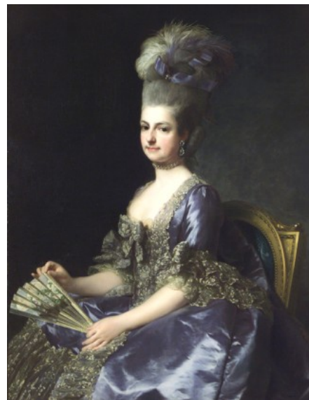
Fig. 1. Roslin, Marie Christine (Vienna, Albertina)