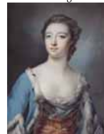
Duchess of Hamilton and ARGYLL, née Elizabeth Gunning