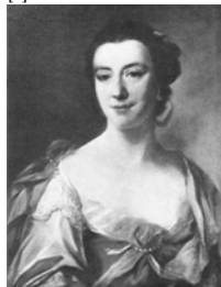
Lady of the ?VALLASTON family