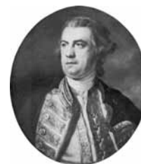
Augustus, Viscount KEPPEL