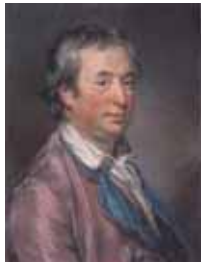
Sir William CHAMBERS