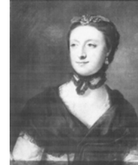
Duchess of LEINSTER, née Lady Emily Mary Lennox