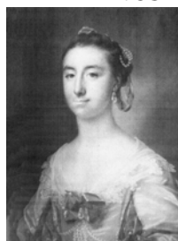
Lady of the MONTAGU family