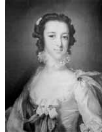
Lady with a ruff