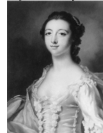
Countess of COVENTRY, née Maria Gunning