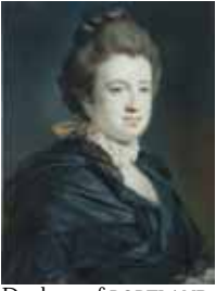
Duchess of PORTLAND, née Lady Dorothy Cavendish