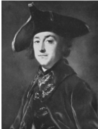
Gentleman in a three-cornered hat