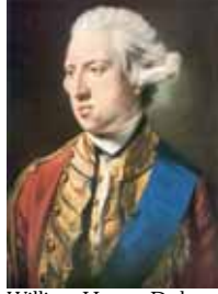
William Henry, Duke of GLOUCESTER