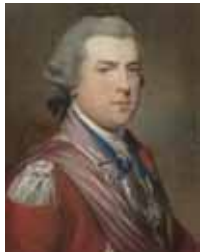
Lieutenant-General William KEPPEL