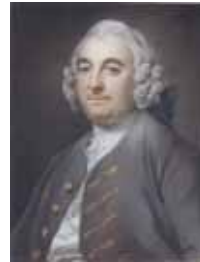
Gentleman in a grey coat