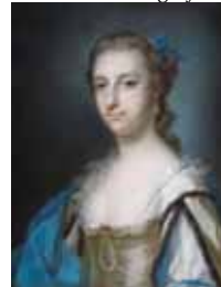
Lady with a blue mantle