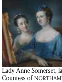
Lady Anne Somerset, later Countess of NORTHAMPTON