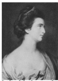
Lady of the ?PHIPPS family