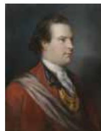
George Keppel, 3 rd Earl of ALBEMARLE