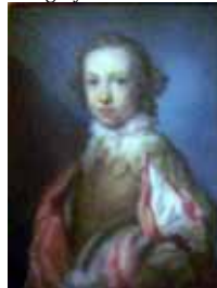
?Charles Dillon, 12 th Viscount DILLON