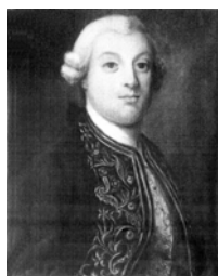
Sir John Proby, 1 st Baron CARYSFORT