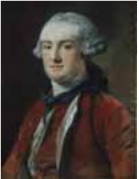
William Henry Cavendish-Bentinck, 3 rd Duke of PORTLAND