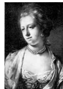
CAROLINE MATILDA, dronning af Danmark