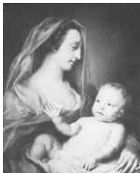
Lady and her child