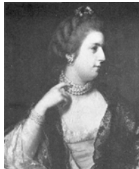
Duchess of GLOUCESTER, née Maria Clements Walpole, Dowager Countess Waldegrave