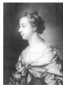
Lady of the MONTAGU family