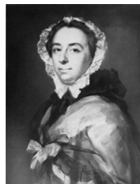
?Margaret "Peg" WOFFINGTON