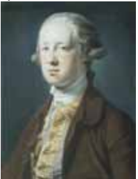
William Cavendish, 5 th Duke of DEVONSHIRE