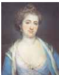
Duchess of KINGSTON, née Elizabeth Chudleigh