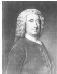
Stephen Fox, 1 st Earl of ILCHESTER