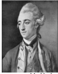
ERNST von Mecklenburg-Strelitz