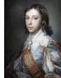
Boy in a Van Dyck costume