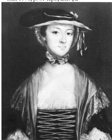
J.7824.107 Lady Caroline HAMILTON, ?pstl, sd → “WWatson/1762” (Earl of Roden 1969; PC 2002). Lit.: Dublin 1969, p. 18, fig. 9; Crookshank & Glin 2002, fig. 119, ?pnt. φ