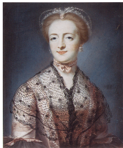
J.7824.109 Miss JONES, pstl, 55.5x43 (London, Sotheby’s, 16.V.1996, Lot 397A, est. £1000–1500, £1600 [=£1840])