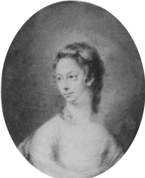
J.79.132 Portraits, pstl, Dublin 1770, no. 56 J.79.133 St John, crayons, Dublin 1771, no. 55 J.79.134 Satyr and Clown blowing hot and cold, crayons, Dublin 1771, no. 56