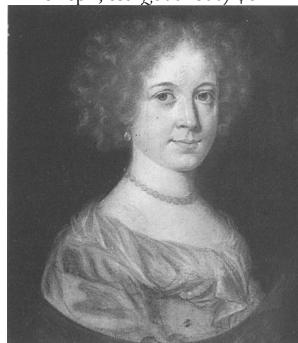
J.788.139 Four portraits of gentlemen and ladies, pstl/blue-grey ppr, one sd 1674 (Lord Astor of Hever; London, Sotheby's, 30.III.1983, Lot 101 repr./n.r., £480 [=£528]) φ