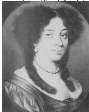
J.788.141 Gentleman with white stock; & pendant: J.788.142 lady in blue dress, pearl choker, pstl, 39.5x32.5, sd 1677/- (Leyburn, Tennants, 15.XI.1996, Lot 453 n.r., £2000. Newmarket, Rowley's, 2.VI.2015, Lot 917 repr./n.r., est. £1000–1500) φ