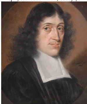
J.788.131 Elderly man, chlk, watercolour, 40.2x34.1, sd → “van wessell fecit/1671” (London, Courtauld Gallery, inv. D.1952.RW.4144. Legs Sir Robert Witt) φ