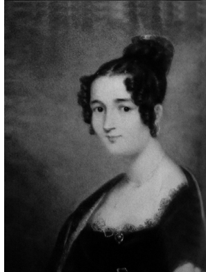
Prinses Friederike Sophia WILHELMINE van Oranjen, née von Preußen (1751–1820), 1790