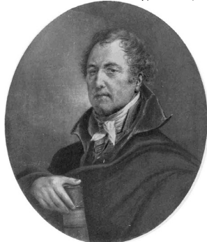
FRIEDRICH WILHELM zu Braunschweig-Öls ( Amsterdam, Sotheby's, 27.III.2007, Lot 189 repr., attr. [v. German sch.] )

J.7846.101 SELBSTPORTRAIT, pstl, 63.5x52.5 ov., 1814 (Berlin, Akademie). Exh.: Berlin 1906, no. 3318 n.r. Lit.: Brieger 1921, repr. p. 322 ☐