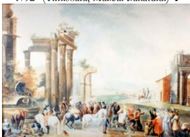
Pastel, 1793