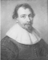
Hendrick KONING, koopman te Amsterdam, m/u. Lit.: Moes 1897–1905, I, no. 1674 LEOPOLD Wilhelm von Baden (1626–1671), zeichnung, 1656 (Karlsruhe, Staatliche Kunsthalle)

L'empereur LÉOPOLD (Firmin Didot 1888). Exh.: Paris 1888, no. 60 [v. B. Vaillant]