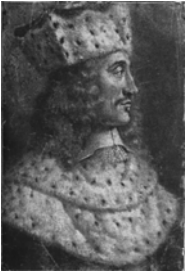
KIEVIT gez. Biscop (1589–1644), pstl, 40x31 (Rijswijk/Amsterdam, Instituut Collectie Nederland, inv. C1500, dep.: Bilthoven PC. Stichtingsakte Fabius). Lit.: rKD repr. \phi