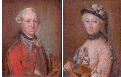
J.98.106 Man; & pendant: J.98.1061 woman, pstl/ppr, 66x52 (Stockholm, Auktionsverk, 5.VI.2003, Lot 2250 repr., est. SKr30–35,000) φ