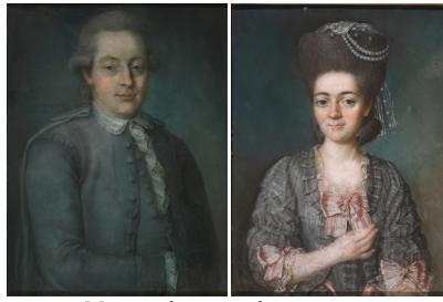
J.98.1056 Man, pstl; & pendant: J.98.1057 woman, pstl (Stockholm, Bukowskis, 26.V.2003) φ

J.98.1052 Man; & pendant: J.98.1053 Dam, pstl (inv.φ)