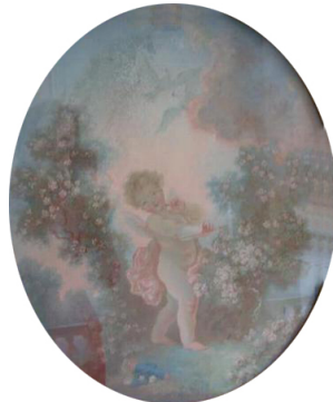
J.65.106 Jeune fille avec des fleurs, a/r Carriera, 54x49.5, sd 1777 (Galerie de Félix-Huet, Village Suisse, 4–8.IV.2002). Lit.: Gazette Drouot , 29.III.2002, repr. Φ