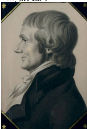
J.648.164 Gentleman in profile, charcoal, pstl/ppr, 47.6x33 (New York, Christie's, 8–9.II.2011, Lot 15 repr., anon. American sch., est. $600–800) [new attr.] φ