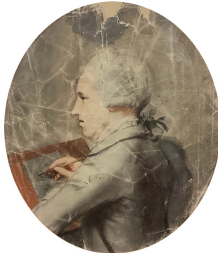
J.669.101 ?SELF-PORTRAIT; & pendant: J.669.102 ?wife, pstl, 72x54 (Donnington, Dreweatt Neate, 8.X.2008, Lot 17 repr., est. £3–4000; Nottingham, Dreweatt Neate, 27.XI.2008, Lot 1 repr., est. £800–1200) \phi\delta

J.669.081 ?[SELF-PORTRAIT], at work, pstl, 25.5x21 ov., s “J. Scouler...” (Derby, Bamfords, 27.X.2020, Lot 2066 repr., anon. unknown, est. £5) [new attr.; new identification, ?] \phi\alpha\delta\nu