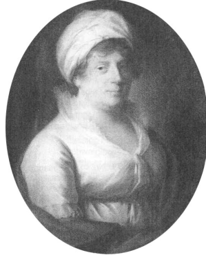
J.667.197 Dame, pstl, 1785 (Brussels, 21.V.1951, BFr 3600)