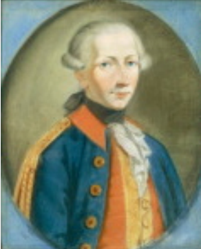
J.6506.106 Gentleman in a blue coat, pstl/ppr, 62.5x50, c.1784 (Milan, Biblioteca Ambrosiana, inv. 413) φ