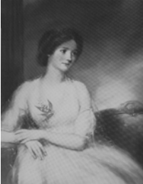
Lady, sd 1794, v. 1792 Lady, pstl, 51x38, sd 1794 (London, Phillips Son & Neale, 14–18.XII.1908, £300) =?Lady, pstl, 53x42, sd “J. Russell/[?]Paint 1794” Arthur Tooth; New York, 19.II.1925, Lot 14, $210; John West Horner, New York) Lady, 60x44.5, sd “J.Russell/1794” (London, Sotheby's, 21.III.2002, Lot 105 repr., est. £2–3000, b/i; Swindon, Dominic Winter Book Auctions, 22.VII.2004, Lot 163, est. £700–1000; Oxford, Mallams, 8.X.2004, Lot 449 repr., est. £800–1200, £1500) Φ