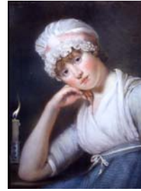
=?girl with a candle (artist's sale; London, Christie's, 14.II.1807, Lot 71, “the effect of the candle-light is expressed with great beauty and truth”)