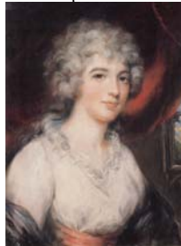
Lady holding a book, pstl, 61x45, sd 1801 (London, Sotheby's Olympia, 14.VII.2004, Lot 34 repr., est. £1000–1500, b/i; London, Sotheby's Olympia, 13.X.2004, Lot 33 repr., est. £500–700, £500) Φ