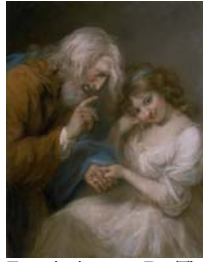
Frontispiece to Dr Thornton's Illustrations of the sexual system of Linnæus , m/u, Royal Academy 1795, no. 294