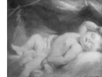
Beggar woman with child, m/u (artist's sale; London, Christie's, 14.II.1807, Lot 111, "painted with peculiar richness and sweet colour"). Lit.: Williamson 1894, p. 122, as with Lord Galway, ?confused with pendant, Filial piety