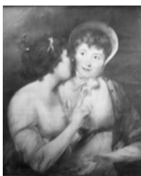
Awake; & pendant: Asleep, pstl, 26x26 (London, Christie's, 22.XI.1977, Lot 110 n.r., £250)