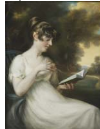
Young woman reading a book in a landscape, pstl, 100.2x75, sd v “John Russell R.A. p.1804” (Captain Stewart Foster. London, Sotheby's, 11.XI.1982, Lot 88 repr., £1800. London, Christie's South Kensington, 31.V.2009, Lot 97 repr., est. £4–6000, £4500) φ