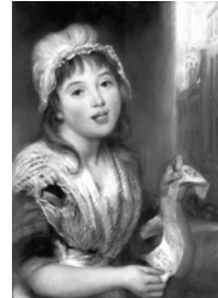
Lady, standing, facing front, half length, pstl/ppr, 1802 (Cambridge, Fitzwilliam Museum, inv. PD.46-2010. Legs Harold Barkley 2010)