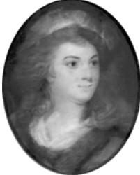
Girl in white in hat, pstl (Truro, Royal Cornwall Museum, 1948.14.2) φ