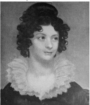
J.598.156 Small portraits in crayons, Dublin 1777 J.598.157 Small portraits in crayons, Dublin 1780, no. 142

~grav. as Miss A. M. Tree, for La Belle Assemblée