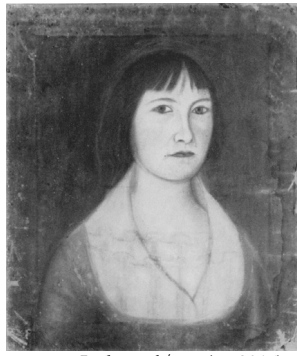
J.5804.133 Lady, pstl/ppr (PC 2016). Attr. φ