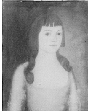
J.5804.139 Boy with large dog, pstl, 49.5x38.1; & pendant: J.5804.14 Girl with rose, pstl, 49.5x38.1 (New York, Sotheby's, 16–19.I.2003, Lot 698 repr., attr., $39,000) φ