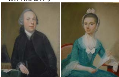
Prinses CAROLINA van Oranje-Nassau (1743–1787), pstl, sd → 1754 (Palais Het Loo) ♀