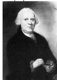
Johann Franz EYTELWEIN (1732–1808), pstl, 33x26 (PC; dep.: Frees Museum, inv. 1963–104). Lit.: Jaarverslag Friesch genootschap , 1963, no. 104; rKD n.r.