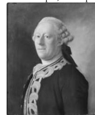
~cop. (Jan Maximiliaan), pnt., 60x48 (Van Tuyll, Heeze Castle, 2001). Exh.: Liotard 1985, no. 46b repr. Lit.: rKD repr., IB 52457