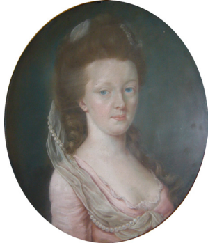
J.4654.106 Lady of the BARNEWALL family, in a light brown dress, pstl, 23x18 ov., sd ✓ “Lawrence”, 1781 (PC 1936). Lit.: McGuire 1936, pl. I φ