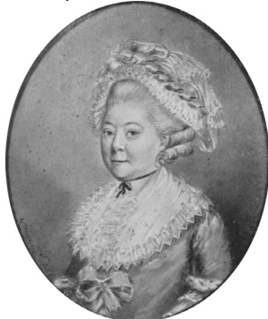
J.4654.108 Young lady of the BARNEWALL family, in a light blue dress, pstl, 23x18 ov., sd “Lawrence 1781 Dublin” (PC 1936). Lit.: McGuire 1936, pl. II φ