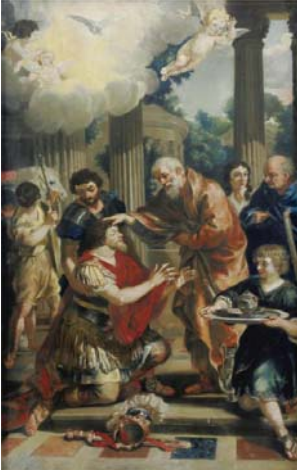
Mars, pstl/vl, a/r Agostino Carracci, 49x38, sd 1785 (London, Sotheby's, 25.II.1998, Lot 144 repr., est. £600–800, £549) φ