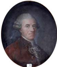
Charles-Eugène-Gabriel de la Croix, marquis de CASTRIES (1727–1801), maréchal de France, ministre de la marine, pstl, 1800. Exh.: Orléans 1895, no. 10 n.r.

Monsieur BONNEFIN, trésorier du duc d’Orléans, à la veste rouge, pstl, 31.5x25.5 ov., inscr. verso “par Dele...” (Maurice Aicardi; Paris, Drouot, Pecheteau-Badin, 26.XI.2007, Lot 88 n.r., est. €600–700) [new attr.; ?] φ