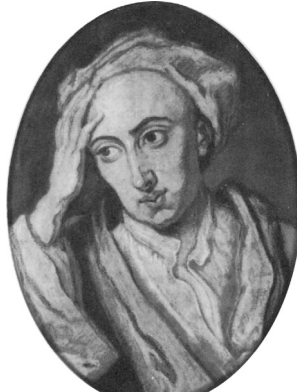
J.4322.124 Frederick, 1 st Duke of SCHOMBERG (1615–1690), KG 1689, pstl, a/r Kneller, 28.5x22.3 (London, National Army Museum, inv. 2004-06-3, attr. Michael Dahl. Dukes of Leeds, Hornby Castle; 10 th Duke of Leeds estate; London, Christie's, 3.vi.2004, Lot 46 repr., est. £2–3000, with pendant) φκσ