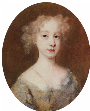
J.4322.105 WILLIAM III (1650–1702), crayons/ppr, 47x38 ov. (Welbeck, Portland collection. Colnaghi; acqu. 6 th Duke of Portland .II.1898). Exh.: Amsterdam 1898, no. 506; London 1950b. Lit.: Goulding 1936, no. 853 n.r.; Oliver Millar, rev. of London 1950b, Burlington magazine , XCII/569, .VIII.1950, p. 234 n.r., ??attr.