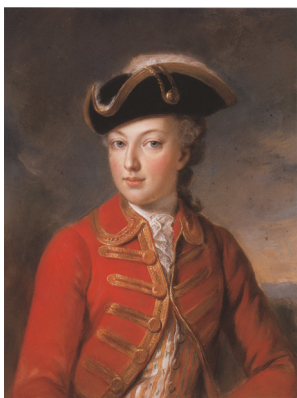
J.4354.105 ~repl., pstl/pchm, 81x66, 1771 (Vienna, Schönbrunn, inv. GG 8770. Comm. Maria Theresia). Exh.: Paris 1894, no 102; Versailles 1927, no. 5; Versailles 1955, no. 11. Lit.: Humbert, Revilliod & Tilanus 1897, no. 10 n.r., as by Liotard; V. & L. Adair 1971, p. 131 repr., attr. Liotard; Iby & Koller 2000, p. 166 repr., as c.1768; Vienna 2017b, p. 180 repr., as c.1772 [=Humbert 1897, no. 10; Fosca 1928, p. 152; Gielly 1935, p. 269; L&R A8] φ

J.4354.103 ~repl., pstl/ppr brun, 60x47.5 (Vienna PC 2008). Exh.: Paris 2008b, no. 56 repr. Lit.: Jallut 1955, pp. 15f φ