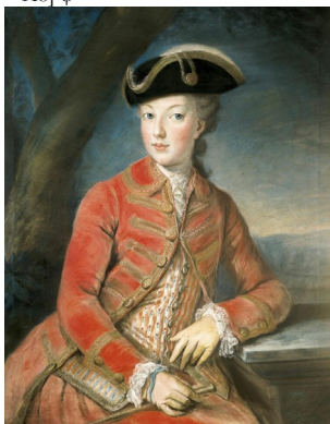
J.4354.107 ~repl., 1772 (marquise de Flers. Montichard, Fontainebleau, 1903)