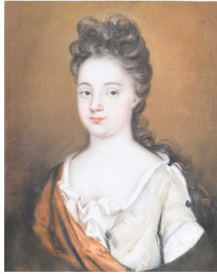
J.42.241 Young lady in a yellow gown, pstl, 27.3x22 (Haslemere, John Nicholson's, 2.X.2019, anon., Lot 247 repr., attr., est. £800–1200; PC 2024) [attr.] φα