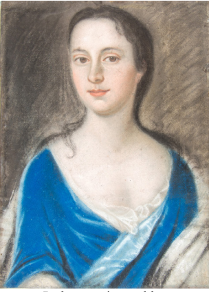
J.42.239 Lady, wearing a blue gown with a rose and lace trim, pstl, 37.5x27.3 (New York, Sotheby's, 18.VI.1999, Lot 1362 n.r., attr., $3737)