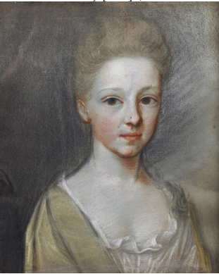
J.42.244 Young lady in an orange gown, pstl, 30x24 (Bury St Edmunds, Lacy Scott & Knight, 2.XII.2023, Lot 1119 repr., anon., £110) [attr.] φα