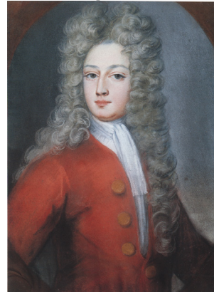
Perceval, v.g. Egmont; Southwell; Titcombe