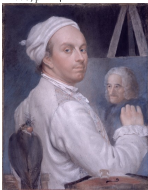
J.407.107 Charles BONNET (1720–1793), naturaliste, pstl, 62x51 (Saladin 1924). Lit.: Baud-Bovy 1924, pl. xii, attr. φα