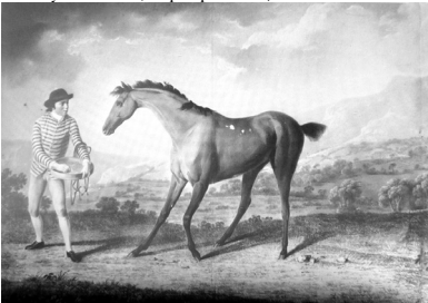
J.3824.123 ~Grey stallion held by a trainer, grisaille pstl, 54x74.3, sd 1768 (London, 15.VII.1983, Lot 16 repr., £17,280) φ