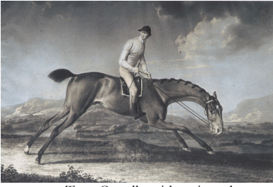
J.3824.119 ~Tom Conolly with trainer, horse and groom, grisaille pstl, 54x74.3, sd 1768 (London, 15.VII.1983, Lot 14 repr., £25,920). Lit.: Tillyard 1999, repr. p. 162 φ