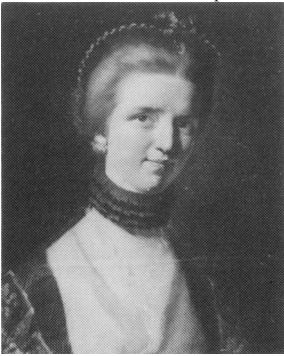
J.3824.148 Lady, seated in a drawing room, with embroidery, chlk, gch., sd 1769 (Col. the Lord Langford, Bodrhyddan). Lit.: Steegman 1957, p. 147 n.r.