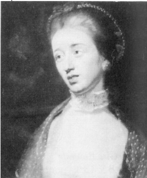
J.3824.152 A lady, black, white chlk/ppr, 29.3x19.8 (London, Christie’s, 10.V.2007, Lot 7 repr., est. £6–10,000, b/i). Lit.: Crookshank & Glin 1994, fig. 69 φσ