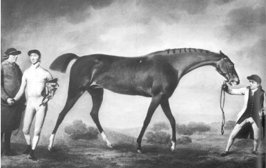
J.3824.121 ~Groom, Grimy Patterson, bridling a horse, grisaille pstl, 54x74.3 (London, 15.VII.1983, Lot 13 repr., £32,400). Lit.: Tillyard 1999, repr. p. 163 φ