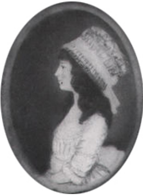
J.382.135 =?man, ov. (Cynthia Walmsely 2010) φ