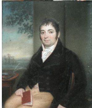
J.382.105 Hon. Charles Andrew BRUCE (1768–1810), later governor of Prince of Wales’s Island, pstl/ppr, 9.1x?, 1788 (PC Scotland) FARL