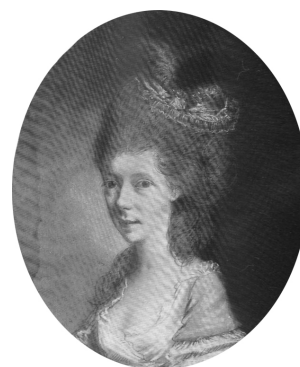
J.375.2169 Lady, pstl, 23x18 ov. (London, Sotheby's, 17.XI.1988, Lot 47, £1800)