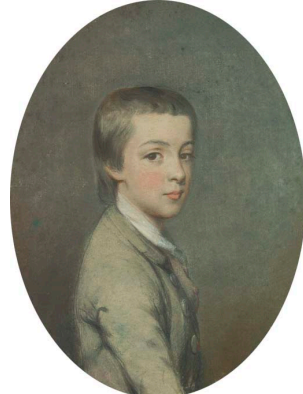
J.375.2249 Young girl, half-length, in profile to the right, in green jacket, pstl, 25.7x20 ov. (London, Christie's South Kensington, 25.III.2004, Lot 7 repr./n.r., est. £2–3000, with pendant, £1700) φ/-