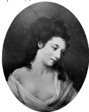
J.375.2135 Lady in a blue dress, pstl, 22x19 ov., sd ✓ "Hamilton/pinx' 1775" (Weald Hall, Colchester, Reeman Dansie, 11–12.VIII.2020, Lot 1128 repr., est. £800–1200) s