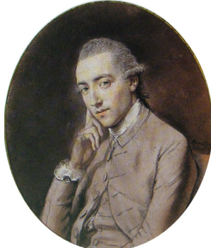
J.375.2231 Homme en habit bleu; & pendant: J.375.2232 Femme en fichu blanc, pstl, 23x19 ov., label verso "Cornelius Callaghan / Carver and Gilder / Looking glass and picture Frame / Manufacture / Dublin" (Chalis, abbaye royale, fondation Jacquemart-André, 1794). Exh.: Chantilly 2004b, no. 102/101, as Hamilton; olim anon. φ