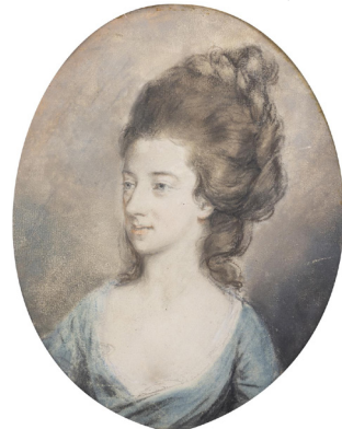
J.375.221355 Lady in a white dress, pstl/ppr, 24x19 ov., [c.1792] (PC, as by Vigée Le Brun; Cambridge, Cheffins, 26–27.III.2025, Lot 177 repr., est. £800–1200) φv