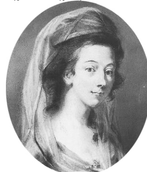
J.375.2178 Young lady in a white dress, pstl/ppr, 23.5x18.5 ov. (London, Bonhams Chelsea, 11.II.1997, Lot 386A n.r., attr., est. £300–500, £200; London, Bonhams Chelsea, 8.IV.1997, Lot 595 n.r., attr., est. £200–300, £220)