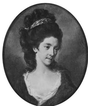
J.375.2143 Lady in a blue dress, pstl, ov. (Malahide Castle). Lit.: Guinness & Ryan 1971, repr. large display [attr.] φ