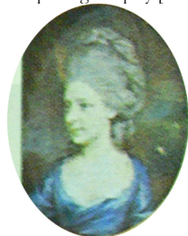
J.375.2147 A lady, pstl (Major Coates, MP, 1904). Exh.: London 1904, no. 366 n.r.