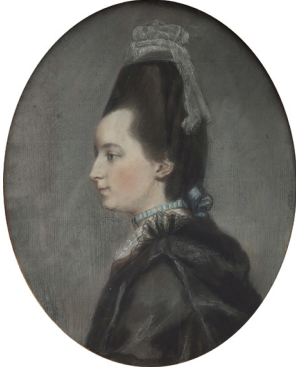
J.375.22132 Lady in a black shawl, blue dress, pstl, 23x28.5 ov. (Durrow, Co. Laois, Sheppard's, 28–29.XI.2017, Lot 239 repr., attr., est. €400–600) φα