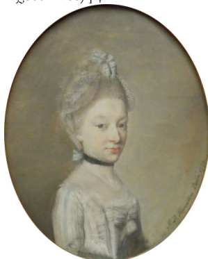
J.375.2125 Lady in a blue dress, facing left, pstl, 24x19 ov., sd 1771 (Lincoln, Golding Young & Thos Mawer, 26.IX.2012, Lot 213, detail repr., est. £800–1200) φ