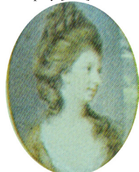
J.375.2145 Lady in a brown dress, pstl, ov. (Malahide Castle). Lit.: Guinness & Ryan 1971, repr. large display [attr.] φ