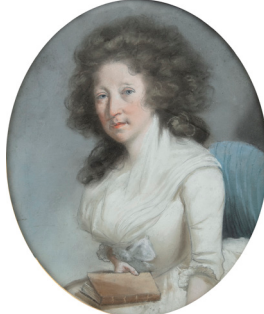
J.375.22135 Lady with long tresses, pstl/ppr, 30x25 ov. (London, Christie's, 14.VI.1977. London, Chiswick Auctions, 30.III.2021, Lot 476 repr., est. £600–800) [attr.] φαv