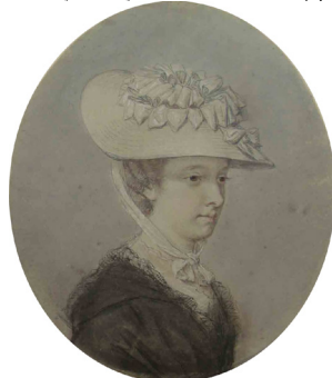
J.375.2162 Lady, pstl, 24x19 (London, Sotheby's, 17.II.1937, Lot 39 n.r., £9; Agnew)

J.375.216 Lady in a hat, pstl/ppr, 25x21.3 ov. (Paris, Drouot, Ader, 15.XII.1934, Lot 169 n.r., as by Vallayer Coster. PC 2014) [new attr.] φv