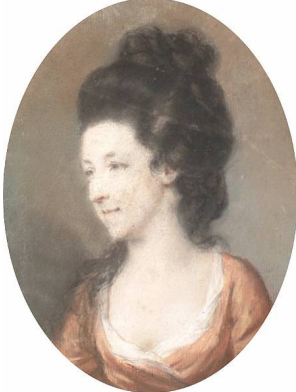
Lady (London, Bonhams Knightsbridge, 7.III.2006, Lot 255 repr., attr. H. D. Hamilton; Dublin, James Adam, 4.X.2006, Lot 181 repr., as by H. D. Hamilton) [v. Gardner]

1.375.2191 Lady in a russet dress, pstl, 23.3x19 ov., inscr. 177? (London, Bonhams Knightsbridge, 12.IX.2006, Lot 262 repr., est. £400–600, £380, Dublin, James Adams, 23.VI.2009, Lot 36 repr., est. €600–800) φ