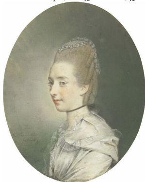
J.375.2132 Lady in a black shawl, muslin bonnet, pink ribbon, pstl, 23x20 ov., sd ✓ "...milton/1773" (PC Washington, DC; Hillsborough, North Carolina, Leland Little, 22.III.2024, Lot 1094 repr., anon. French sch., est. $50, $2800) [new attr.] φv