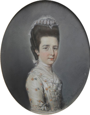
J.375.222 Gentleman; & pendant: J.375.2221 lady, pstl, 28x20 ov., sd 1770 (London, Phillips, 3.XI.1986, Lot 44, £680)