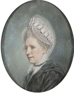
Lady (London, Bonhams Knightsbridge, 7.III.2006, Lot 255 repr., attr.) [v. West]