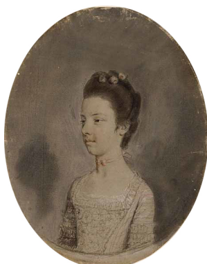
J.375.2119 Young woman, in black shawl, pstl, pencil/ppr, 26.7x21.5 ov., sd "H D Hamilton Delin' 1770" (PC) φ