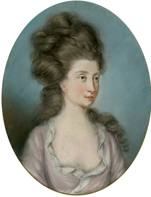
J.375.22133 Young lady in a lace cap, pstl/ppr, 23x18 ov. (Dublin, Adams, 15.X.2019, Lot 208 repr., est. €800–1200) [attr.] φαv