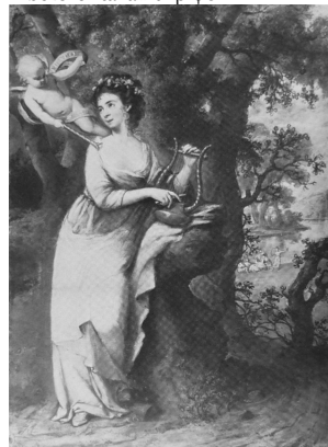
J.375.2166 Young woman, pstl, 23x18 ov. (London, Phillips, 3.XI.1986, Lot 5, £300)