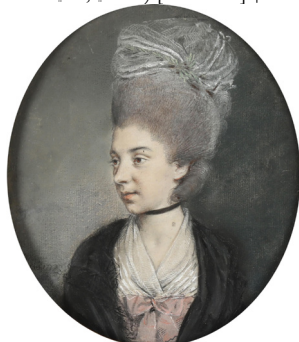
J.375.2133 Lady, pstl/ppr, 23x19 ov., 1774 (University of Limerick, inv. Wood.1993.046)