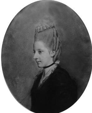
J.375.113 ~cop. Alice Foljambe, pnt., 35.5x30.5 ov. (Cecil George Savile, 4 th Earl of Liverpool, Kirkham Abbey, 1905). Lit.: Lord Hawkesbury, "Catalogue of...portraits at Kirkham Abbey...", Transactions of the East Riding Antiquarian Society , XIII/1, 1906, p. 3, pl. II