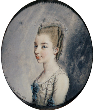
J.375.1291 [?][Duchess of DEVONSHIRE as Hebe, pstl, 22x19 ov., c.1777 (Drogheda, Adam's, 16.X.2018, Lot 210 repr., est. €600–800) [?identification; ?eye colour] øvø