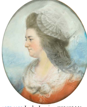
J.375.1197 Lady Louisa CONOLLY, pstl, 23x19 ov. (Castlecomer, Mealy's, 13–14.XI.2007, Lot 1028 repr., attr., est. £1000–1490) φ