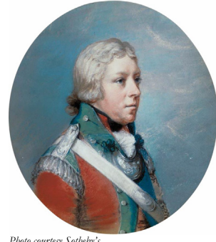
J.375.1214 Sir Corbett CORBETT, né Davenant (1752–1823), pstl, 23x21 ov., 1794 (London, Christie's South Kensington, 25.III.2004, Lot 12 repr., est. £600–800, attr., £2000; London, Sotheby's, 25.XI.2004, Lot 118 repr., est. £2500–3500, £2600) Φ