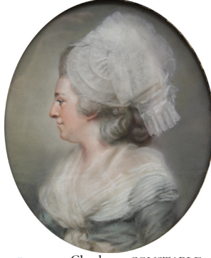
J.375.1199 Lady Louisa CONOLLY, pstl, 23x18 ov. (Colchester, Reeman Dansie, 28–29.IX.2010, Lot 1078 n.r., with two others (Foster and Holford), est. £500–700, £6800) φ