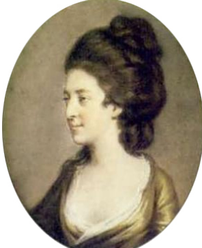
J.375.1193 ~repl., pstl, 23x20 ov. (Duke of Leinster, Carlton, cat. 1885, p. 35, no. 18)