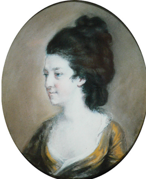
J.375.1194 ~repl., pstl, 23x18.5 ov. (Springhill, National Trust, inv. 215954, SPR/P/829, 9e) Φ