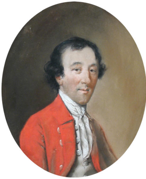
J.375.1189 Tom CONOLLY, pstl, 23x19 ov. (Castlecomer, Mealy's, 13–14.XI.2007, Lot 1028A repr., est. £3470–4460) φ