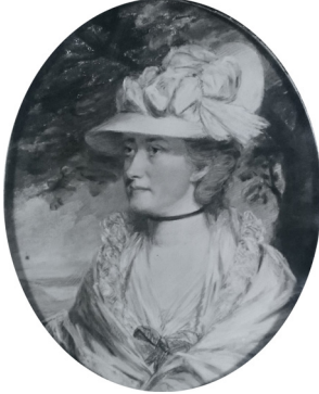
~?grav.: anon., as the Rt Hon. the Earl of Hillsborough (Dublin, NGL, inv. NGL10619) Downshire, v.q. Hill Duncombe, v. Hale

J.375.1315 La maréchale DU MUY, née Marie-Antoinette-Charlotte de Blanckart (1731–1803), wearing the ribbon of a chanoinesse du chapitre de Neuf, Allemagne, half-length, in a white dress with blue trim, seated half to right, looking straight, pstl, 23x18.5 ov., sd v “H. D. Hamilton delin 1771” (Althorp; not located 2005; London, Christie’s South Kensington, 7–8.VII.2010, Lot 454 repr., as of Mme de Muys, est. £1000–1500, £750). Lit.: Garlick 1976, no. 264 n.r. φσ