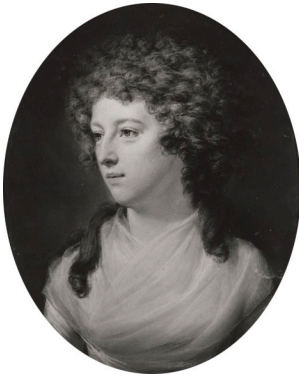
J.375.1289 Duchess of DEVONSHIRE, née Lady Georgiana Spencer (1757–1806), ov., sd 1771 (Chatsworth). Lit.: Foreman 2001, repr. p. 16 φ