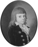
J.3936.13 Guillaume-Jean-Jacques NAIRAC (1787–1845), pstl/ppr, ov. (Oegstgeest PC). Lit.: rKD repr. φ