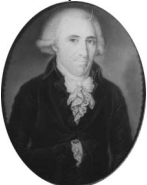
J.3936.139 ~repl., pstl (Groningen PC) Lit.: 131. Bericht des Historischen Vereins Bamberg , 1995, p. 322; rKD n.r.