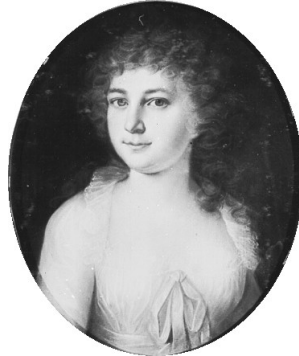
J.3936.149 Jeune femme en robe bleue, sd verso “Higchmann/pinxit 1791”, pstl, ov. (Lille, musée de l'Hospice comtesse) φ