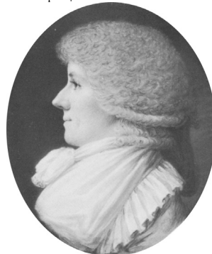
J.3892.121 Unknown lady, pstl/ppr, 13.4x10 ov. (Stockholm, Nationalmuseum, inv. NMB2254. Legs Carl Fredrik Dahlgren 1894; Dahlgrens samling; transferred 1908)