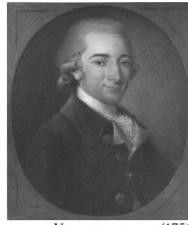
J.484.061 Yves SOULIGNAC (1758–1823), député à la Convention nationale, pstl, 57.5x44.5, sd √ illisible "Li.../1795" (PC 2018; Paris, Drouot, Millont, 29.XI.2018, Lot 77 repr., attr. Lieurneur, est. €300–500) [new attr. 2023, ?] φαυ