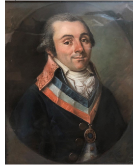
J.3856.081 Homme en habit gris, pstl, 60x48, sd √ "Henry Pinxit/1785" (Geneva, Genève Enchères, 29.IV.2024, Lot 3001 repr., est. SwFr200–300, SwFr170; PC) φ