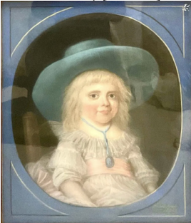
J.3856.103 Portraits, pstl, Salon de Toulouse 1772, no. 9 J.3856.104 Portrait, pstl, Salon de Toulouse 1773, no. 144 (M. Mours 1773)