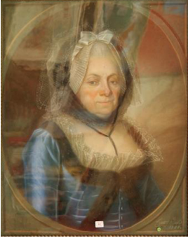
J.3856.102 Jeune fille, pstl, 58x48, sd \ illisible 1792 (Perpignan, Ruffat, 26.II.2025, Lot 351 repr., est. €100–150) [new attr.] φν