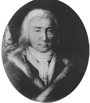
brun, gillet bleu, revers rouges, pstl, 20x18 (Paris, bibliothèque du conservatoire de musique, inv. E.995.6.74. Olim Grétry). Lit:: Georges de Froidcourt, Correspondance générale de Grétry, Brussels, 1962, pl. xviii, anon. [attr.; 2] ora

1.36.102 André-Ernest-Modeste GRETRY (1741–1813), compositeur, pstl (Liège, musée Grétry. Don ville de Liège). Lit.: Hippolyte Fierens-Gevaert, Musée Grétry, catalogue illustré, 1913, p. 21, no. 1 n.r.; Bruyr 1931, pl. 1, attr. φα