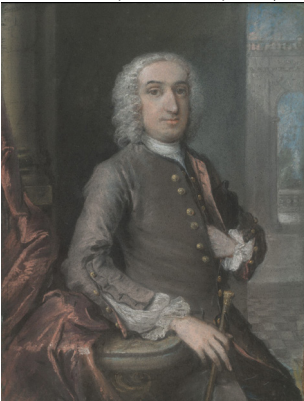
J.3314.118 Gentleman in a blue coat, pstl/ppr, 61.2x46.2, c.1745 (Dublin, NGI, inv. 7342). Exh.: Dublin 2023. Lit.: Wynne 1982, no. 5 n.r.; Le Harivel 1983, repr., attr. φ