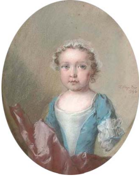
J.3314.14 Three portraits, pstl, Society of Artists 1761, no. 32