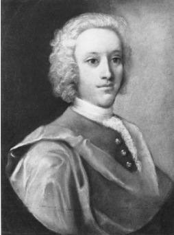
J.3314.117 Man, pstl/bl. ppr, 36.4x27.3, inscr. 1734 (New Haven, Yale Center for British Art, inv. B1975.4.1519). Exh.: New Haven 1979, no. 246 n.r., attr.