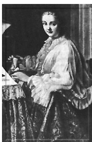
M. de FOULON, 40x31, sd "1762. Frédou" (Charles Oulmont 1927). Exh.: Paris 1927a, no. 18, no pl.

Jean-Baptiste HERSOU (1722–1780), pstl, 36.5x28, sd "Frédou 1762" (Versailles, 9.III.1997, Lot 61) Φ