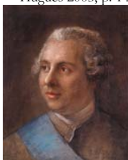
LOUIS XVI, 1788 (Versailles MV 8410), v. a/r Callet

LOUIS, duc de Bourgogne, dauphin (1729–1765), pierre noire, cr., pstl/ppr, 41.5x31.5 (Versailles MV 9109. PC Lorrain 2003; acqu. 2007). Exh.: Paris 2008b, no. 37 repr. Lit.: Hugues 2003, p. 143 repr. φ