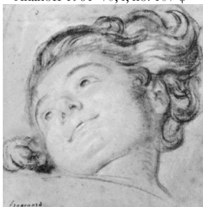
J.323.133 Tête de femme de grosseur naturelle, coiffée en cheveux, pstl (Paris, Dufresne, Basan, 2.V.1781 & seq., Lot 123)

J.323.131 ~étude, tête de jeune femme, pstl/ppr gr., 17x17 (Frédéric Villot; Paris, Delbergue, Vignères, 16–18.V.1859, Lot 113. Paris, Palais d'Orsay, Ader, Picard, Tajan, 14.XII.1979, H88,000). Lit.: Wildenstein 1960, p. 16 n.1 n.r.; Ananoff 1961–70, I, no. 107 φ