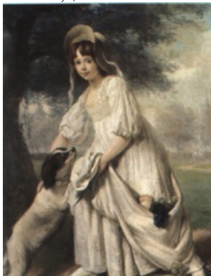
J.314.106 Femme pensive, pstl/pchm, 54x44 ov., inscr. verso (Cerca Trova, Paris, 2025) φα