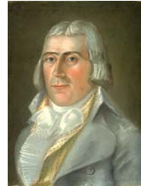
François NOISEUX, pstl, 36.5x28.8, 1796 (Québec, MNBA, 1978.84. Acqu. 1978). Lit.: Chronique des arts , 1979, no. 144 repr. φ