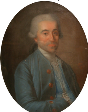
~pseudo-pendant, Lallemand fils q.v.