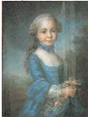
Femme tenant des fleurs (Versailles, Palais des congrès, 1.IV.1990, Lot 27 repr., attr. Carriera). Lit.: Jeffares 2006, 162Aii, attr. H. Drouais [v. Glain]