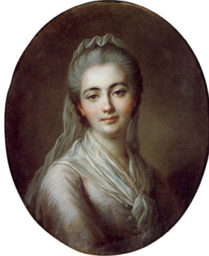
J.2818.141 Femme au voile, pstl, 57.8x46.7 ov., inscr. verso "Collection du comte de Choiseul. Attribué à Nattier" (London, Sotheby's Olympia, 13.XII.2001, Lot 374 repr., Éc. fr., est. £1200–1800, £5875). Attr. Φαα