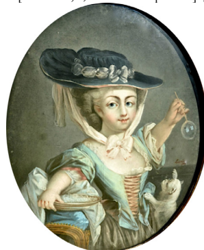
J.2818.158 J.2818.16 ~cop., pstl, 64x54, inscr. "Le prince 1763" (Bordeaux art market 2013) [new attr., ?; cf. Mme Laperche] φ