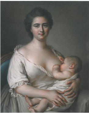
J.2818.129 ~version, pstl, 82x65 (Alfred Forgeron (1842–?1910). Vendôme, Rouillac, 7.VI.2015, Lot 103 repr., atelier de F.-H. Drouais, est. €4–6000) φβ