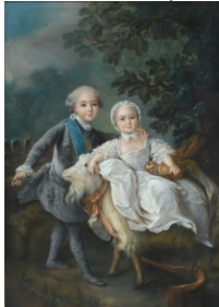
J.2818.151 ~cop., pstl, 85x68.5 (Rancho Santa Fe, McNally's, 22.VI.2014, Lot 353 repr., est. $900–1800) φκ