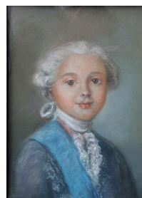
Le château de cartes a/r F.-H. Drouais, comte d'ARTOIS; & pendant: Les bulles de savon, a/r F.-H. Drouais, Madame Clotilde