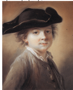
J.2818.164 ~version, ?Alexandre-Marie-François-de-Paule de DOMPIERRE D'HORNOY (1742–1828), petit-neveu de Voltaire, pstl (Ferney). Lit.: Henry Matthews, Diary of an invalid , London, 1820, p. 359, "very prettily done in crayons"; Étienne de Jouy, L'Ermite en province , XCH, 1822, p. 450 n.r., anon., inconnu, le petit ramoneur du château de Ferney; Choudin 1994, fig. 15; Apgar & al. 1999, pl. IX, ?attr. Mme Dompierre; Paolo Bassani Pacht & al., Dessins du musée des Beaux-Arts de Tours , 2013, p. 40 repr. [attr.] φαδβσ