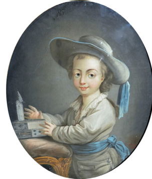
Jeune garçon au tricorne, pnt., 65x54 ov. (Louvre RF 1977-14. Legs Mlle Edith Blum 1976)