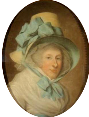
J.244.127 Elderly lady in blue dress, white fichu and bonnet, black lace mantilla, ermine muffs, pstl, 59x44, sd → "S. Cotes Pxt /1790" (Gallery Verite, Winchester 2018) φ