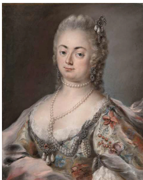
J.198.105 Marco BALBI VALIER (1748–1823), pstl/ppr , 47x38, c.1752 (Venice, Ca’ Rezzonico, inv. Cl. I n.1455. Desc.; legs 1906). Lit.: Lorenzetti 1936, p. 22, visible in fig. 7; Mariacher 1969, p. 15, as Carlevarijs, no. 54 repr., as Carriera; Delorenzi 2023, fig. 10 φ