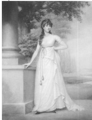
J.185.134 Lady in a white dress, standing, full length, pstl/ppr, 46x35.5 (London, Sotheby's, 16.VII.1998, Lot 19 repr., est. £2–3000, £3400) φσ