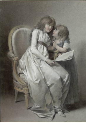
J.163.123 La jeune mère, pstl, 59x48 (Paris, Aponem Deburaux, 7.IV.2010, Lot 6 repr., est. €400–500, €500) [Attr.] φ?αv